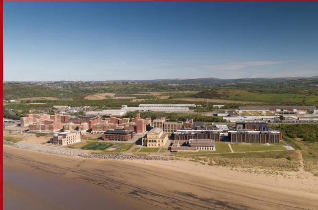
Swansea Bay University Campus