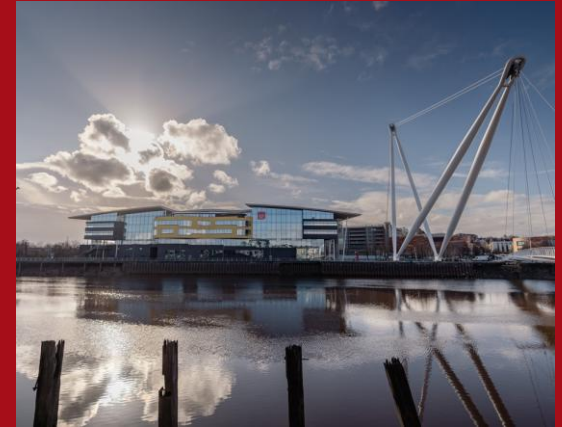
University of South Wales