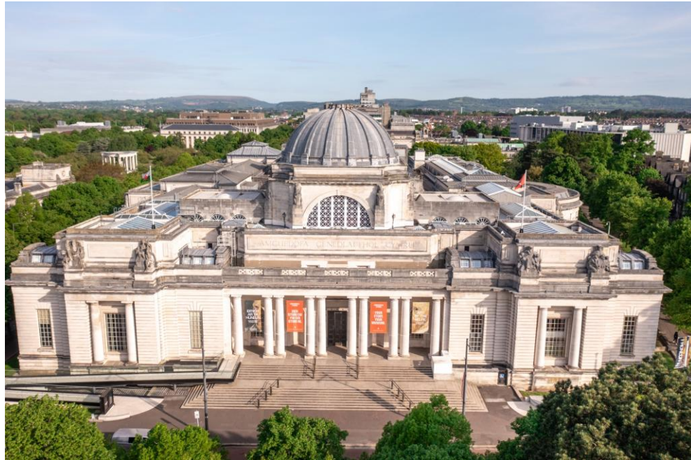
National Museum, Cardiff

Wales is home to 7 National Museums with research-led resources spanning underground coal mining, Welsh life and identity, to art, archaeology, and natural sciences. They provide immersive cultural contexts for gala dinners and curated delegate experiences that support associations working across industry and engineering, social history and culture environmental and natural sciences, heritage conservation, and education.