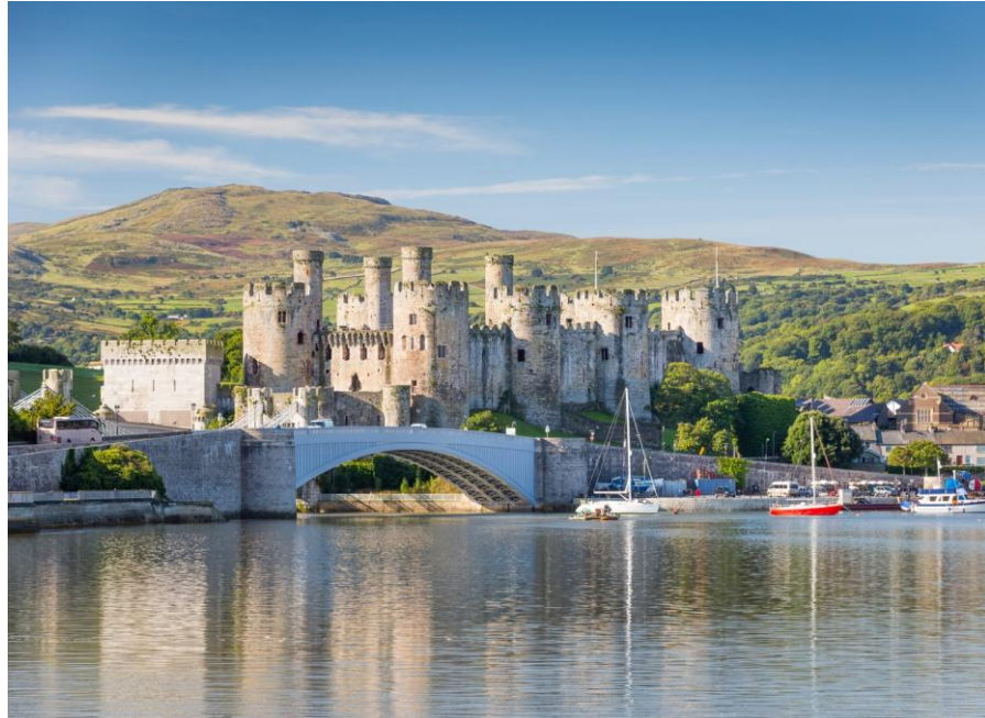
Conwy, North Wales