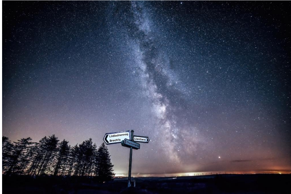
Dark Sky Wales

Wales stands out for its excellence in dark-sky conservation, hosting 3 International Dark Sky Places (accredited by the International Dark-Sky Association, IDSP)—including two of only 23 global Reserves and Europe's first Dark Sky Sanctuary. This demonstrates Wales's ongoing commitment to night-sky protection and sustainable destination management, offering delegates immersive, ambassador-led experiences that support wellbeing and environmental stewardship.