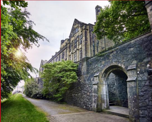
Bangor University

These universities also provide association with access to flexible, high-quality conference meetings spaces across Wales and memorable delegate experiences.