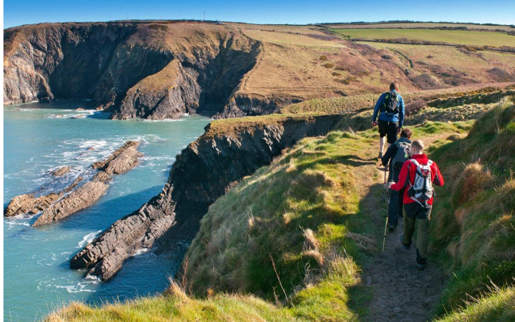
Wales Coast Path

Wales was the first country with a formal trail along its entire coast. The Wales Coast Path, 1,400 km long and connects with Offa's Dyke Path for a 1,658 km route around the Welsh border with England. The trail features varied landscapes including coastal views, fishing villages, and estuaries, offering delegate experiences to link place, environment, health, and innovation, and support wellbeing, engagement, and environmental stewardship.